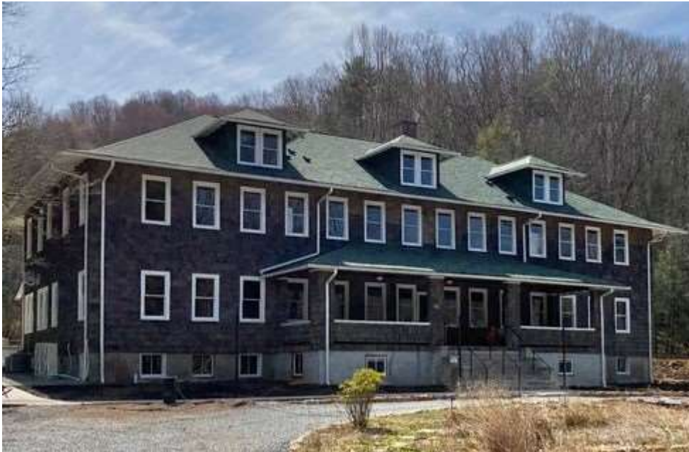
The restored Konnarock School, once home of the ATC Konnarock Crew.