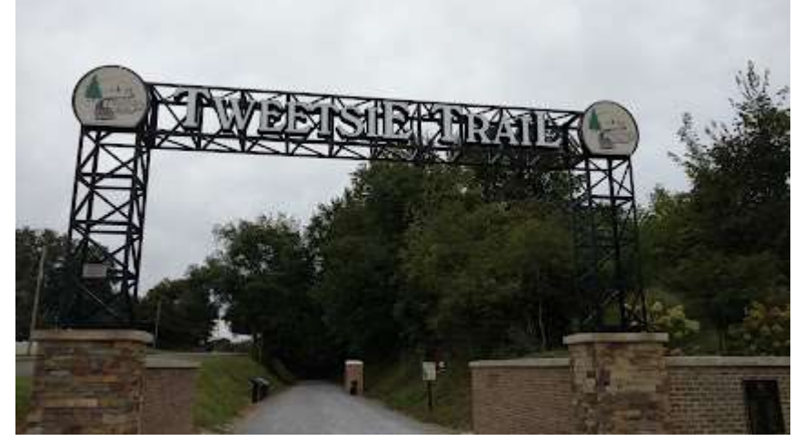
Johnson City Tourism

workshops are almost always valuable, and it's good to spend time, either on the trail or in late-night bull sessions, with hikers and maintainers from other trail clubs and parts of the country. I particularly enjoyed a Saturday workshop and worktrip with eight other hikers – including New York City and Massachusetts teenagers just learning this stuff. We talked about controlling water on the