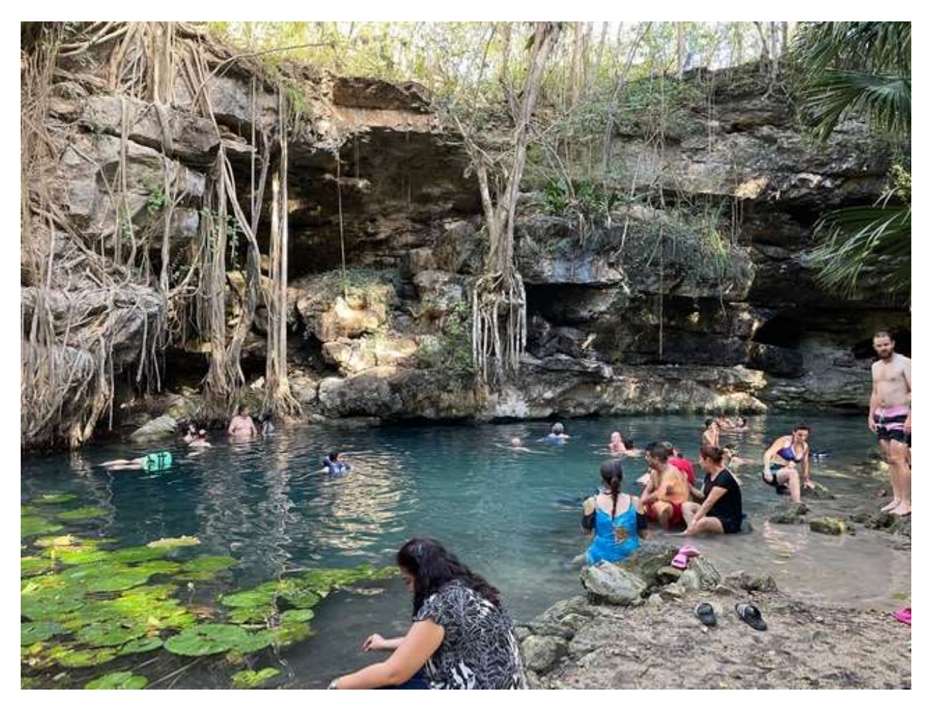
Swimming in a cenote, a geological oddity thought to date to a strike by an asteroid.