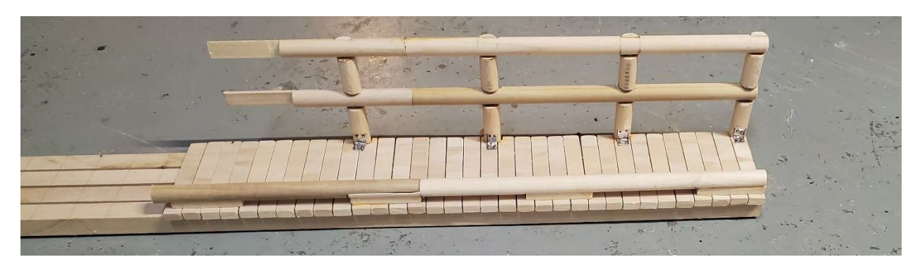
April 19-21, 2024

Trail survey and maintenance, with a potluck or meal out on Saturday night. We're looking for wintertime damage to our trail sections and putting together a work schedule for spring. We may also work on reconstruction of the Hunting Camp Creek bridge near Jenkins Shelter. This is Ron Hudnell's model of what it will look like.