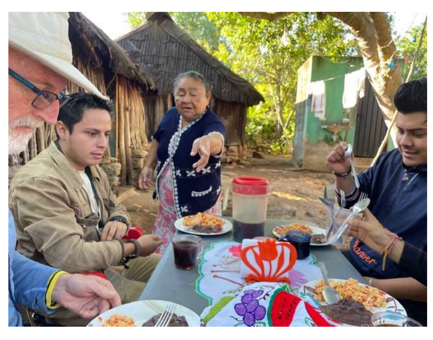
The trails may have been boring, but the food was great!

The Yucatan region was invaded by Spaniards beginning in the 1500s. They built palatial homes called haciendas and enslaved the Mayans to run